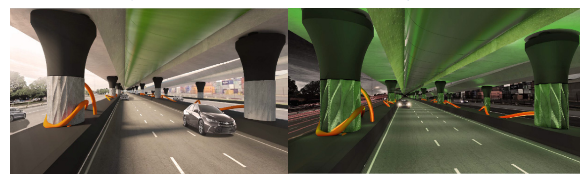
Typical section of elevated structure