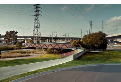
View of pedestrian bridge over Footscray Road near Docklands