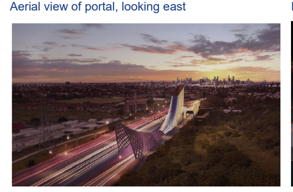
Figure 6-6 Southern portal