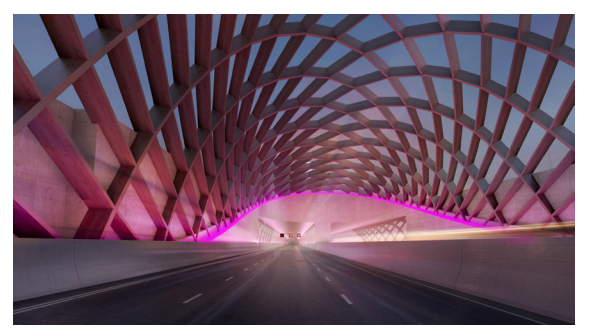
Portal entrance heading south into tunnel