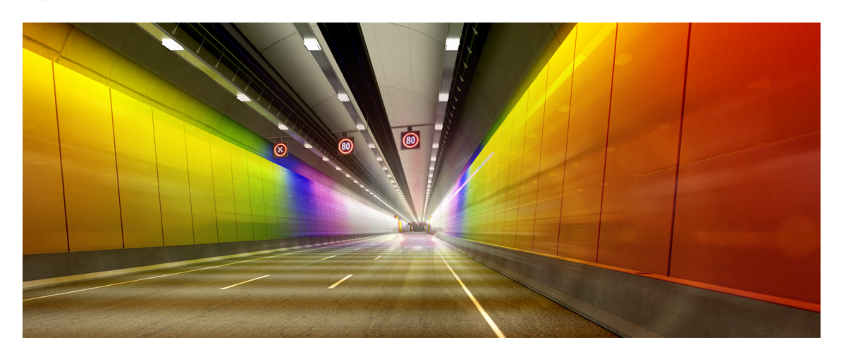
Figure 6-9 Driver view of tunnel interior