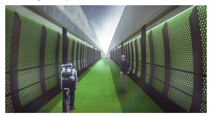
View along veloway interior