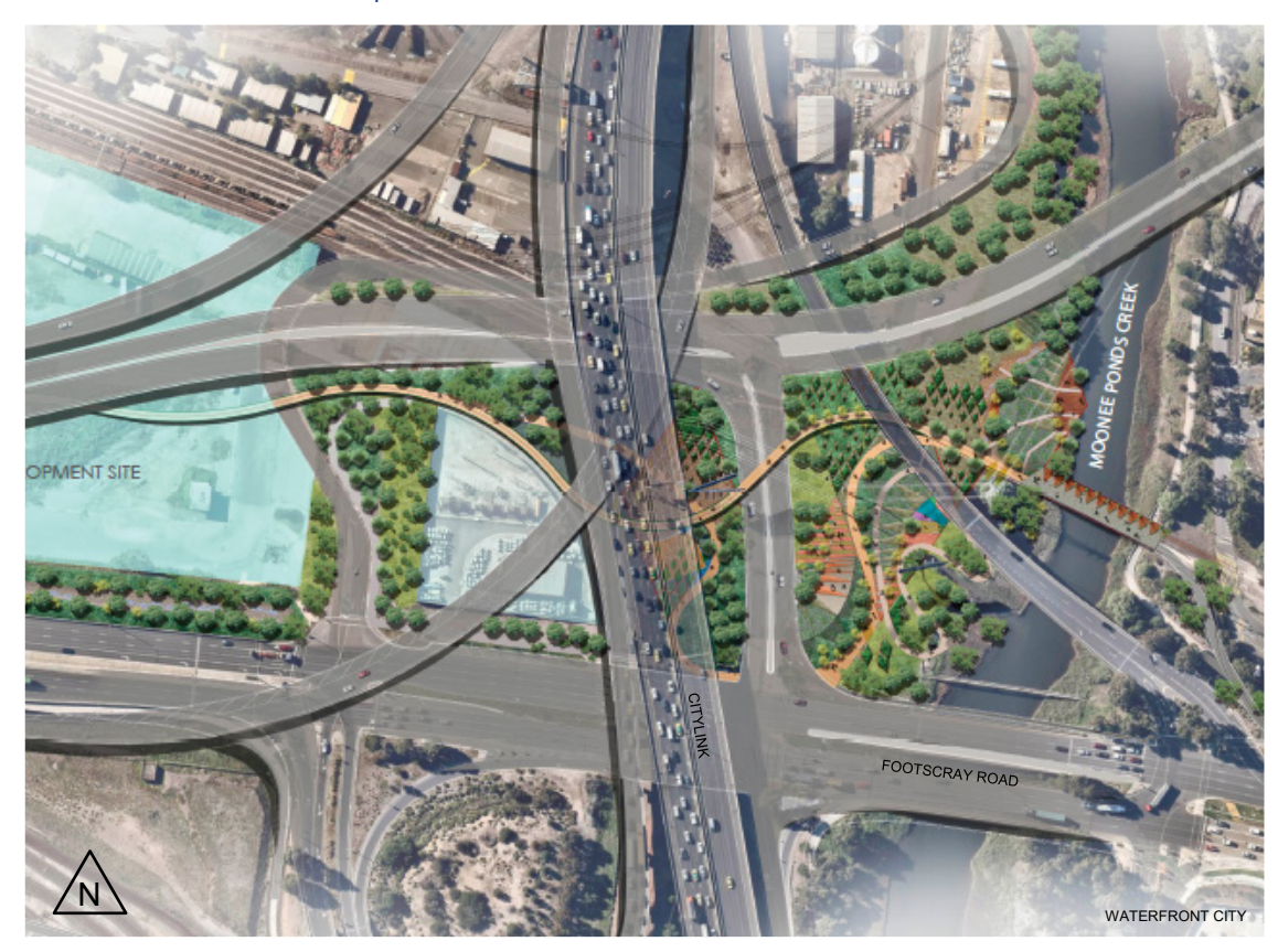
View of City Gateway feature looking east