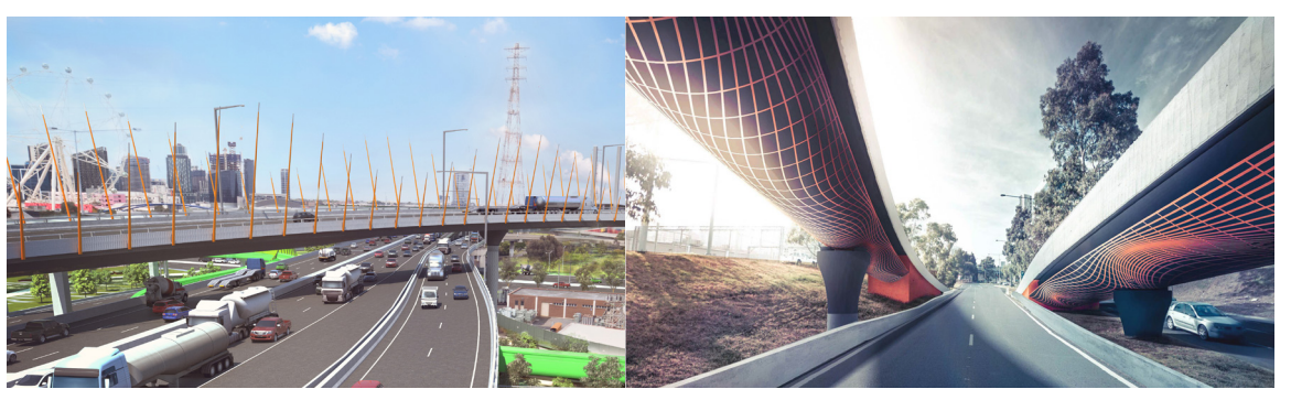
Wurundjeri Way extension