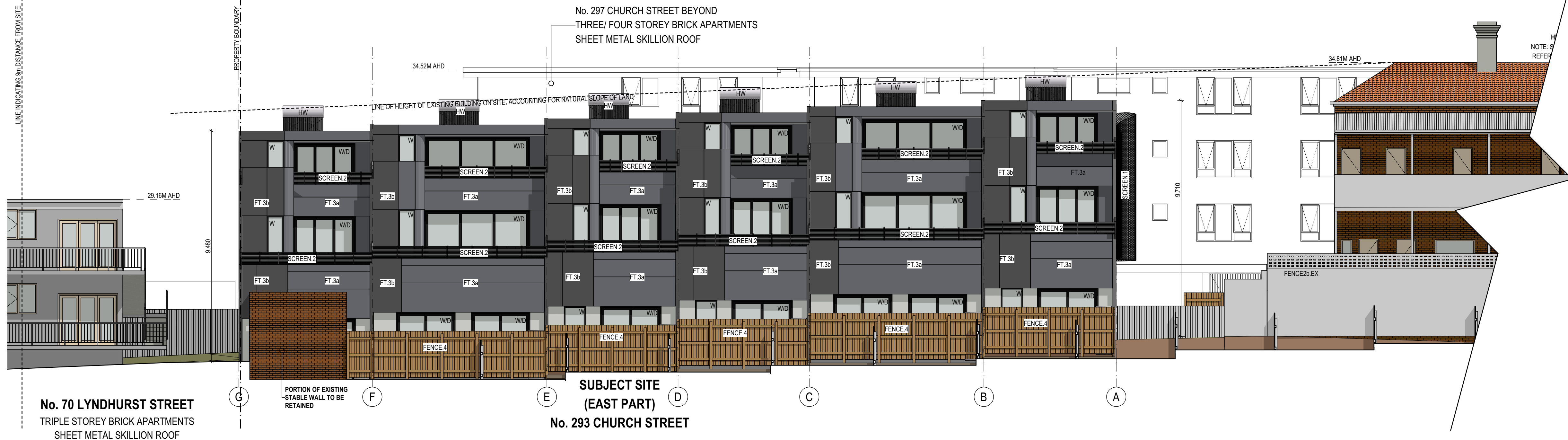
Proposed North Elevation (Coloured) Scale @ A1: 1:100