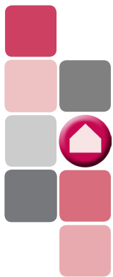
Table 2 Criteria for applying the NRZ, GRZ and RGZ